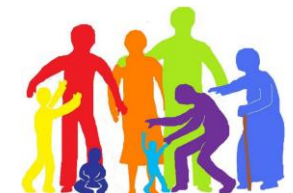
Ages and Stages

In accordance with government guidelines and legislation, we challenge prejudice and discrimination in all its forms; we aim for every child to feel safe and valued within our school and community.