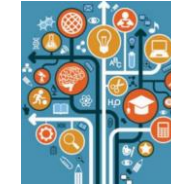
Talents and Interests

Inclusion and diversity promotes equality and values the differences between people. Equality is about ensuring individuals are treated fairly. Diversity is about recognising and respecting these differences to create an all-inclusive atmosphere. By promoting equality and diversity in school, we create an environment where we can all thrive together and understand that individual characteristics make people unique and special.