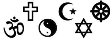
Religion and Faith