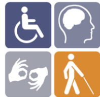
Needs and Abilities